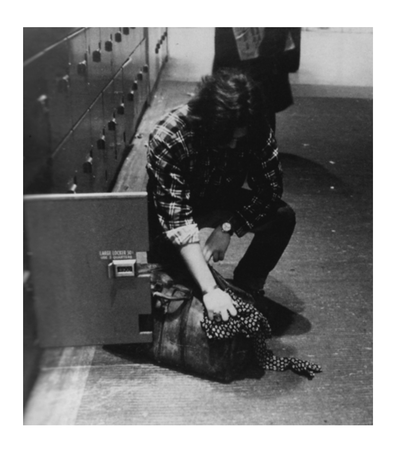
Stimulus 3 Photograph: Port Authority (Mystery No. 12), by Mac Adams (1975)